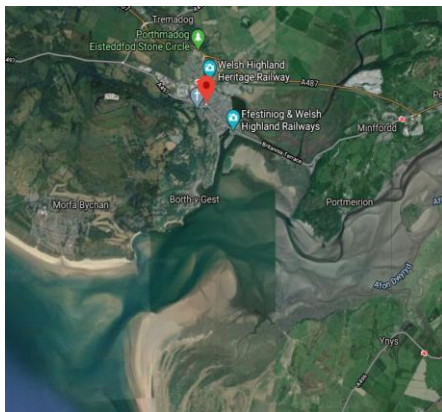
The Porthmadog Estuary

We are looking to extend paddles next year to round trips to The George III. This is a fantastic paddle on a good day, a must do.